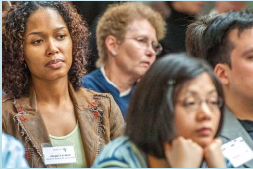
King County Voters