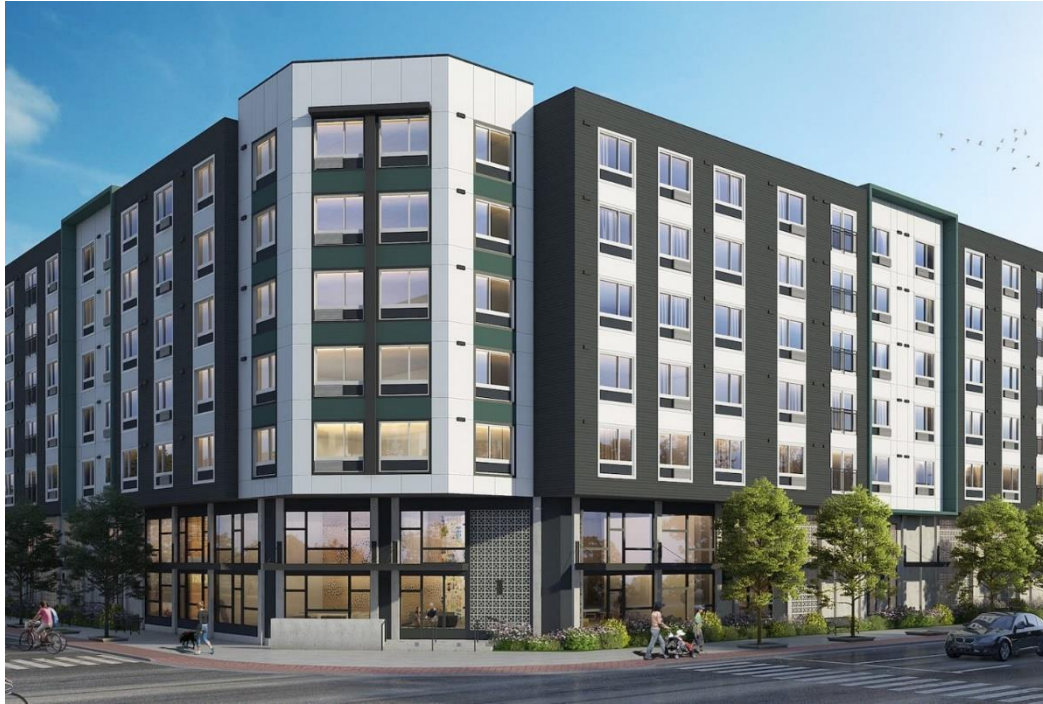
Prose at Southcenter Spring 2025