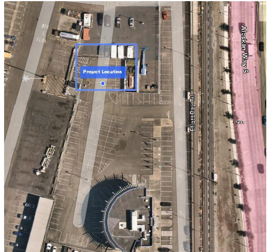
Figure 2. Project Location